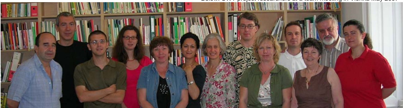
Below: UWT project researchers at a team meeting in Vienna May 2007

The UWT project started in March 2007 and will run for two years when a final conference will be held to present the major findings.